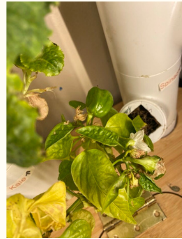
Growing Kale, Lettuce, Peppers and Other Vegetables in Hydroponic Gardens