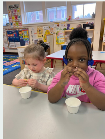
Weekly Food Tasting

Teachers also read stories about gardening, and some teachers went above and beyond expectations to create visuals to discuss how each food grows or is produced. Our teachers are amazing!