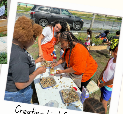
Creating bird feeders to attract pollinators.